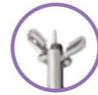
Oval Fenestrated with Spike