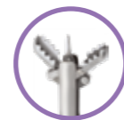
Alligator with Spike