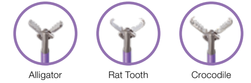
Alligator Rat Tooth Crocodile